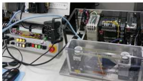
Factory automation technology seminar