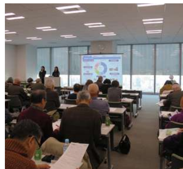
Information session for individual investors

We are also unique in that we hold joint information sessions with other companies.