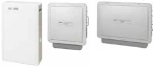
Hybrid Storage System for Solar Power