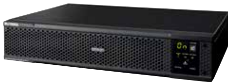
Uninterruptible Power Supply Units