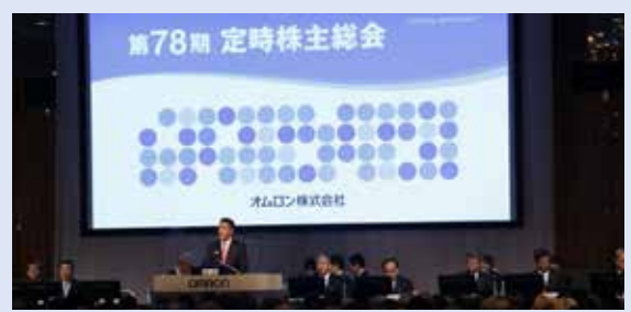
The 78th Ordinary General Meeting of Shareholders