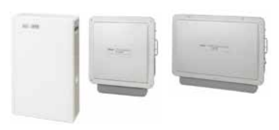
Hybrid Storage System for Solar Power